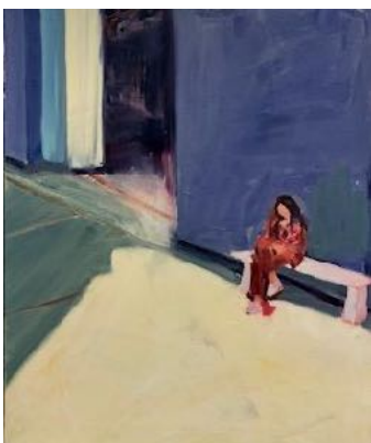
Munisha Gupta Waiting Outside 2