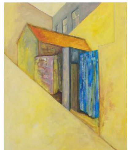
Sarah Lang Memory Lane 120cm x 100cm Acrylic on canvas £1950 framed