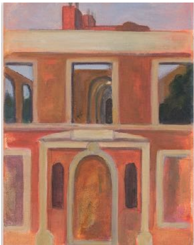
Sarah Lang Clogs to Clogs 120cm x 100cm Acrylic on canvas £1950 framed

For more information or to purchase please contact email: sarah@sarahlangart.co.uk