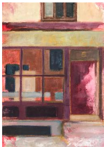
Sarah Lang Shadows 120cm x 100cm Acrylic on canvas £1950 framed