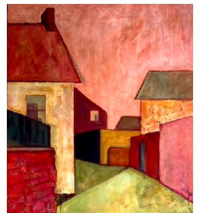
Sarah Lang Mad Dogs and Englishmen 70 x 90cm Acrylic and mixed media on canvas £1450 framed